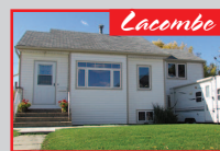
4711 49 AVENUE $239,900 MLS CA#0092454