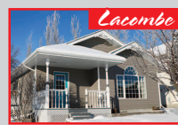
14 COUNTRY RIDGE CLOSE $279,900 MLS CA#0096037