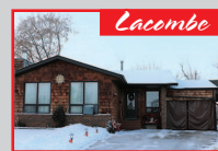
37 WILLOW CRESCENT $329,900 MLS CA#0096307