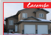
79 TERRACE HEIGHTS DR. $385,000 MLS CA#0096296