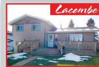
49 BRUNS CRESCENT $325,000 MLS CA#0093991