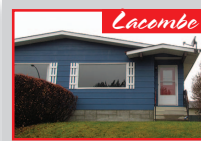
17 GREEN COURT $189,900 MLS CA#0090500