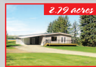
4402 50 STREET $449,000 MLS CA#0091140