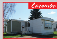
61 PARKLAND ACRES $29,900 MLS CA#0087591