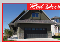
3 LANDRY CLOSE $525,000 MLS CA#0092261