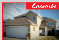
40 ELIZABETH PARK BLVD $419,000 MLS CA#0095242