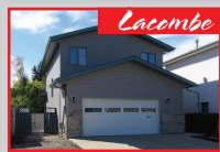
5627 53 AVENUE $319,900 MLS CA#0089102