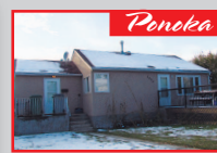
3908 45A STREET $209,800 MLS CA#0093901