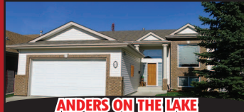
ANDERS ON THE LAKE

Hillside Bungalow with INDOOR POOL overlooking CITY OF RED DEER! This home has it all! Extensive Reno's! 7 tier water fall, beautiful curb appeal.