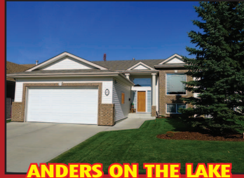
ANDERS ON THE LAKE

Hillside Bungalow overlooking CITY OF RED DEER! This home has it all! Extensive Reno's! 7 tier water fall, beautiful curb appeal.