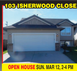
103 ISHERWOOD CLOSE OPEN HOUSE SUN. MAR 12, 2-4 PM

NOW TAKING ON NEW SELLERS AND BUYERS PLEASE CALL 1-403-598-7913