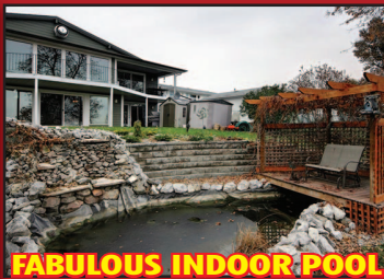
FABULOUS INDOOR POOL

Hillside Bungalow overlooking CITY OF RED DEER! This home has it all! Extensive Reno's! 7 tier water fall, beautiful curb appeal.