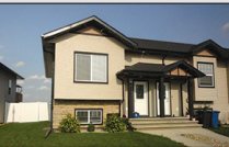
120 HENDERSON CRES. PENHOLD - JUST LISTED!

Awesome 3 bdrm fully finished townhome. Yard is fully fenced with 2 car parking pad. Upgraded flooring and stainless appliances! Call Alex