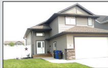
21 CHURCHILL PLACE JUST LISTED!

Awesome 3 bdrm fully finished townhome. Yard is fully fenced with 2 car parking pad. Upgraded flooring and stainless appliances! Call Alex