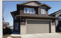
187 MORRIS COURT