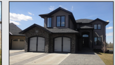
96 OAKWOOD CLOSE

15 Min to Red Deer and Sylvan Lake. Private acreage! Almost 3 acres, walk out, fully finished home with triple garage. Custom built with loads of great features! Call Alex