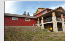
39215 RANGE RD 284

Large modified bi-level located in the heart of Blackfalds features four bedrooms and 3 bathrooms. Modern design with neutral colours.