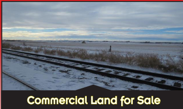
Commercial Land for Sale

130 acres. Ideal property for various types of industries requiring rail service.