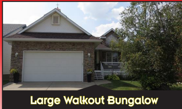
Large Walkout Bungalow

130 acres. Ideal property for various types of industries requiring rail service.